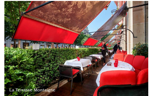
La Terrasse Montaigne

Refined French cuisine | Al fresco dining on avenue Montaigne