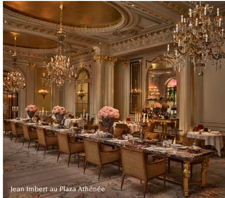
Jean Imbert au Plaza Athénée