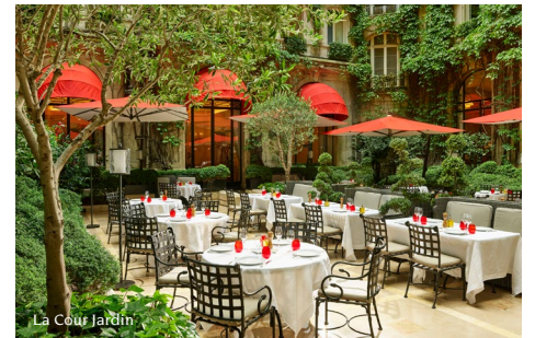
La Cour Jardin

Charming outdoor courtyard | Ever-changing seasonal menu | Winter ice rink