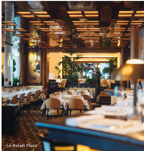
Le Relais Plaza

One Michelin star | French traditions reinvented | Gilded interiors