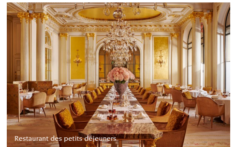
Restaurant des petits déjeuners

Freshly-baked pastries | Brunch every weekend